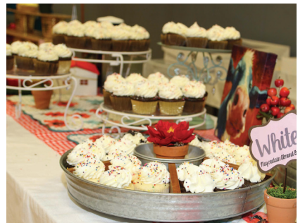
An array of cupcakes and sweets were the featured dessert, as members filled the Paoli Jr./Sr. High School gym (left) to enjoy a catered meal before the business meeting.