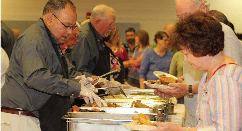
Orange County REMC directors serve up tasty food, catered by the Schnitzelbank restaurant.