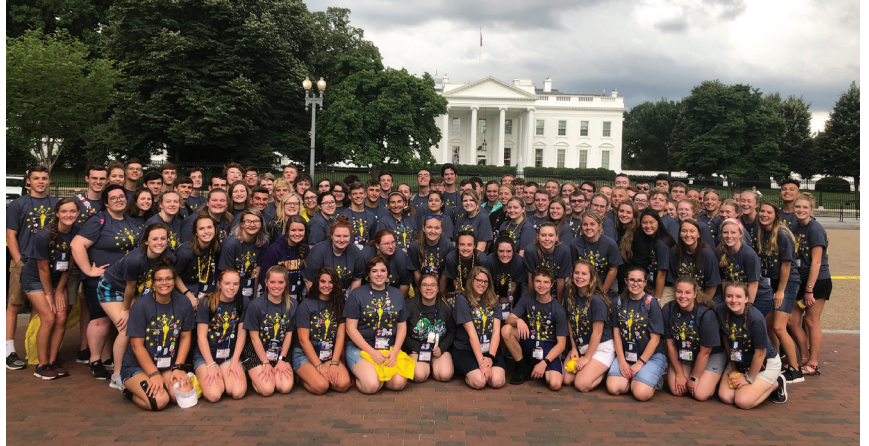
The Indiana Youth Tour delegates stop for a photo in front of the White House. Indiana's Electric Cooperatives sponsored 104 students on the 2019 Youth Tour to Washington, D.C. Other features of the trip included Arlington National Cemetery, Gettysburg, the Flight 93 Memorial, a day on Capitol Hill and an All-States Youth Rally. Students also visited several museums and enjoyed a cruise on the Potomac River.