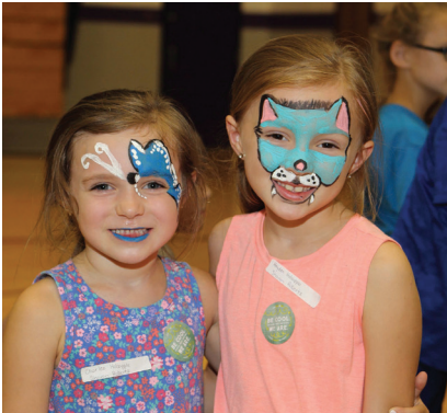
Two young members show off their freshly painted faces at the annual meeting. The kids' program also featured inflatable bounce slides.